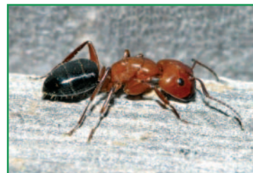
Figure 1. Adult carpenter ant.

Carpenter ants are relatively large. Adults (Fig. 1) vary in length from about ¼ inch to ⅝ inch for worker ants, and up to ¾ inch for winged