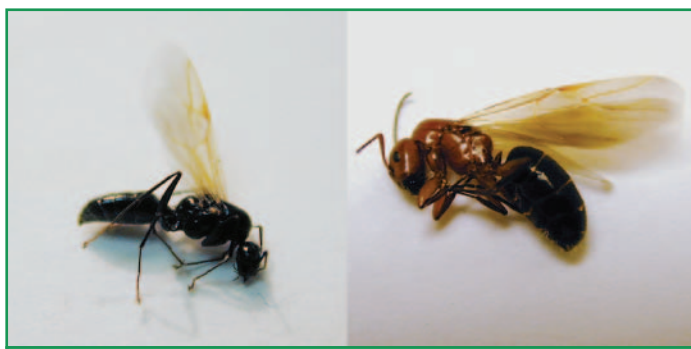
Figure 3. Winged reproductives—male on left, female on right.

After establishing the nest, the female lays eggs and cares for the larvae by feeding them with fluids secreted from her body. Under favorable conditions, the larvae grow, pupate, and become adult worker ants in 4 to 8 weeks. After becoming adults, the new generations of workers expand the nest, excavate galleries, and take over the task of providing food for the queen and larvae.