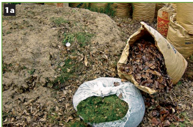
Figure 1. Grass clippings and leaves (a) make good compost. Leaves compost faster if they are shredded before being added to the pile(b).