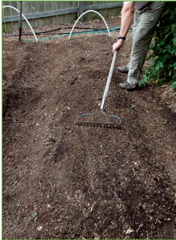
Figure 7. After the compost area has rested for a few months, turn the soil. It is ready to be used for planting.