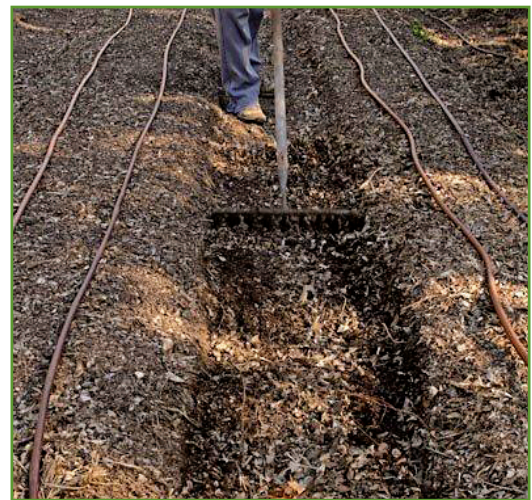
Figure 6. Cover the composting material with the original soil from the hole or trench.