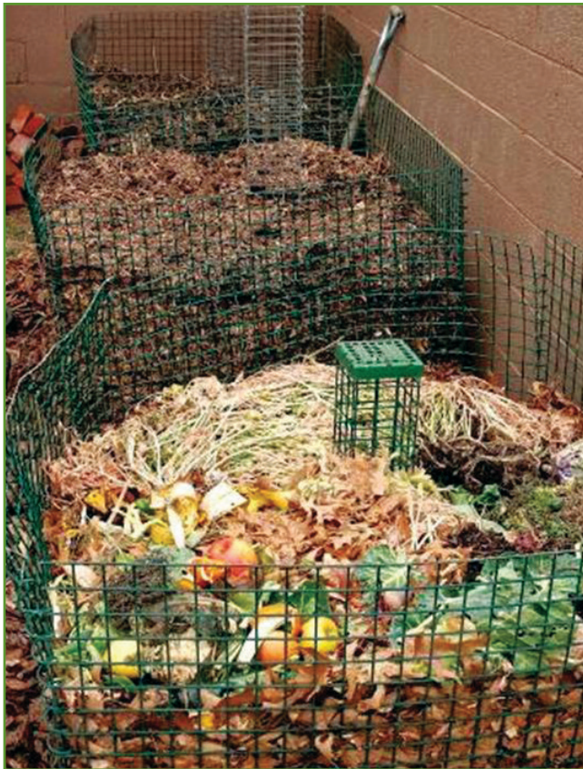
Figure 4. Compost bins.

Turn the pile weekly during the summer and monthly during the winter to increase the rate of decomposition. About 90 to 120 days are required to prepare good compost using the layer method. If you have room, make three piles so you will have one ready to use, one being tilled, and one being filled up (Fig. 4.)