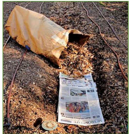
Figure 5. After digging a hole or trench, fill it with newspapers and dry leaves.