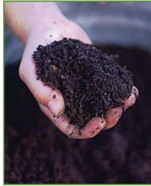
Figure 3. Humus ready for use in the garden.

As microorganisms begin to break down the organic material, heat is generated. Within a few days the compost pile should reach an internal temperature of 90 to 160 degrees F. This process will destroy most weed seeds, insect eggs, and disease organisms, producing rich, soft humus or compost (Fig. 3.)