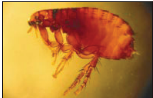
Cat fleas are the most common fleas on dogs and cats. They also infest raccoons, opossums and coyotes.

Cat fleas do not normally live on humans, but do bite people who handle infested animals. Flea bites