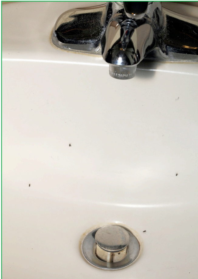
Figure 10. Sinks are common breeding sites for moth flies and fungus gnats.

To check whether a drain is breeding site, place a length of clear packing tape across the drain without