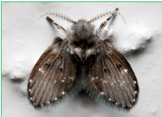
Figure 3. Moth flies, also called drain flies, breed in microbial films that grow in drains. These moths are often seen resting on walls near the drains from which they emerge.

Adult drain flies are small ( \frac{1}{16} to \frac{1}{5} in, 2 to 5 mm), greyish, and densely covered with hairs. They hold their broad wings either flat or like a roof over the body at rest. Drain flies usually fly only a few feet at a time.