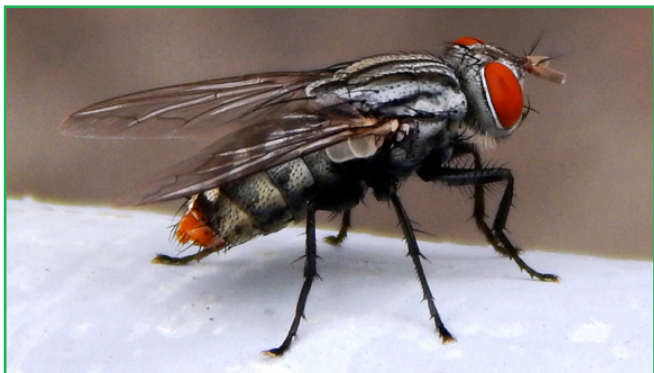
Figure 7. Flesh flies are large gray flies that occasionally enter homes when attracted by the odor of a dead animal in an attic, chimney, or wall.

Carrion flies include flesh flies (Family Sarcophagidae) and blow flies (Family Calliphoridae). Immature stages of blow flies feed on decaying organic material—especially dead animals but also garbage, manure, or other rotting plant material. Blow fly larvae are creamy white and legless. Sometimes referred to as maggots, blow and flesh fly larvae are cylindrical and taper to a pointed head. The presence of these larvae in a home usually indicates that a bird, squirrel, rat, etc., has died somewhere in the structure.