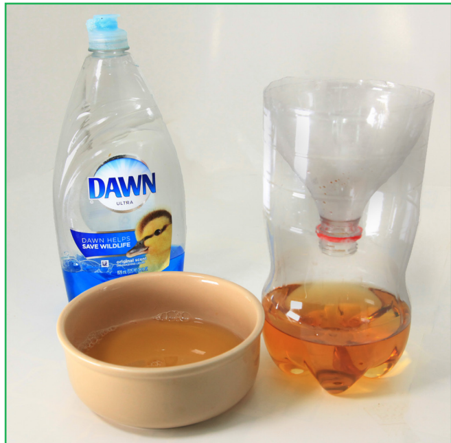
Figure 7. Inexpensive fruit fly traps can be made with readily available items. An open bowl with a liquid attractant and small amount soap will catch lots of flies (soap breaks the liquid surface tension, causing landing flies to drown). Another effective trap can be made by cutting off the top (funnel section) of a 2 liter soft drink bottle. By inverting the top inside the base you create a funnel trap into which fruit flies can fly, but not easily escape. Good attractants include apple cider vinegar, red wine, beer, or just sugar water and yeast.

In natural settings, fruit flies are attracted to fermenting fruits. Suitable attractants for traps include