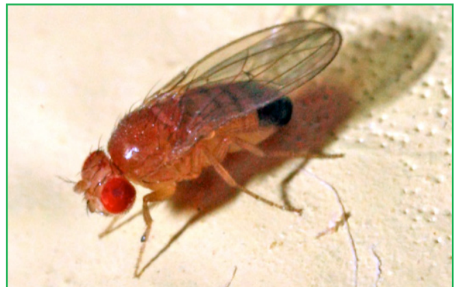
Figure 1. Fruit flies are one of the most well studied insects because of their usefulness in genetics research. Their stocky bodies and red eyes help distinguish fruit flies from other small indoor flies.

Fruit flies (Family Drosophilidae) are common indoors and out. Infestations are most frequent during the summer when fruit flies are active outdoors—