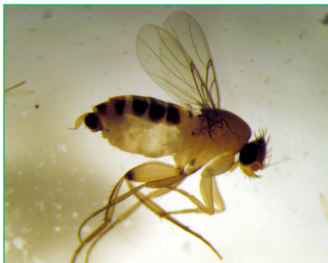
Figure 2. Phorid flies are similar in size to fruit flies, but are humpbacked, with strong veins along the front edge of the wings. These flies frequently run or hop rather than fly, as suggested by their enlarged femur in the hind pair of legs.

Phorid flies (Family Phoridae) are another fly found in homes and, even more commonly, in commercial buildings. They are approximately the same size as fruit flies ( \frac{1}{8} inch, 2 to 4 mm) but have a hump-backed appearance. They are tan to dark-brown or black. Phorid flies have dark veins along the front edge of their wings. The veins in the central part of the wings are almost parallel and lack the linking cross veins seen in most other fly wings. Phorid flies have enlarged femurs on the third pair of legs, which make them good runners. They often run and stop repeatedly before taking wing, giving them another common name, “scuttle fly.”