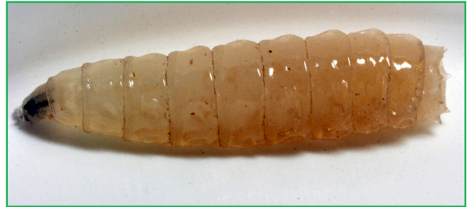
Figure 9. Blow fly maggots may wander into living spaces of homes prior to their change into an adult fly.

Adult blow flies are shiny blue or green and are \frac{1}{4} to \frac{7}{16} in long (6 to 11 mm). Flesh flies are large ( \frac{3}{8} to \frac{5}{8} in, 10 to 16 mm) and gray with black stripes on the thorax. The tip of the abdomen is red or pink in some species.