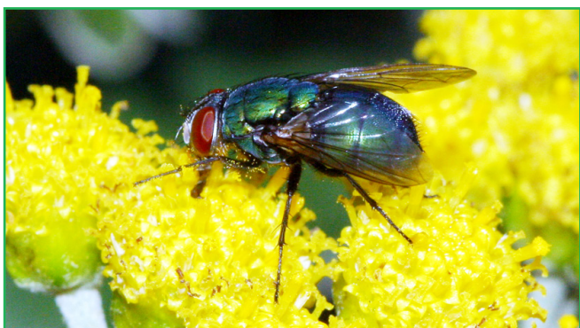
Figure 8. Blow flies are normally outdoor flies, but will enter homes to lay eggs on dead rodents, birds or other carrion.

Maggots in homes are usually those that have completed feeding and are searching for a place complete their metamorphosis. Left undisturbed, they will pupate in a crack or other protected spot and emerge as an adult fly.