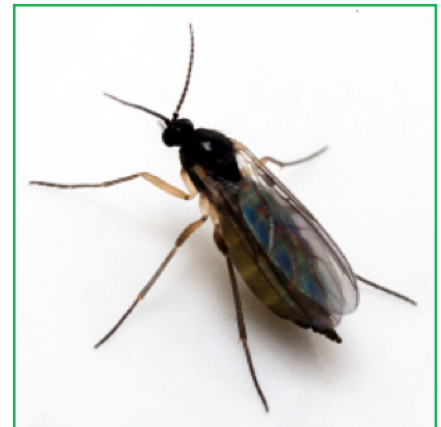
Figure 4. Adult fungus gnats emerging from potting plants do not bite, but can be highly annoying indoors.

Infestations from potted plants can be eliminated by moving the pots outdoors. These infestations are most common during the winter months, when overwatering is more common. When plants cannot be