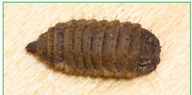
Figure 6. Soldier fly larvae are one of the strangest looking insects likely to be found indoors. They are most commonly associated with compost bins or a dead animal in the structure.