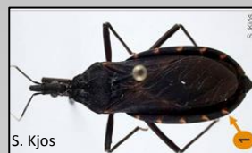
Triatoma indictiva Adult female

Chagas disease initially causes a localized reaction (see photo above right), but the parasite can later affect the heart and digestive tract, and can ultimately cause death. No vaccines exist, and medications are few and not always effective.