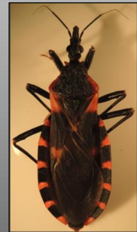
Adult female Triatoma sanguisuga