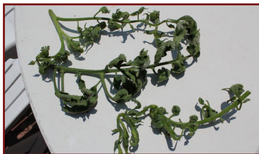
Figure 1. Twisted tomato leaves