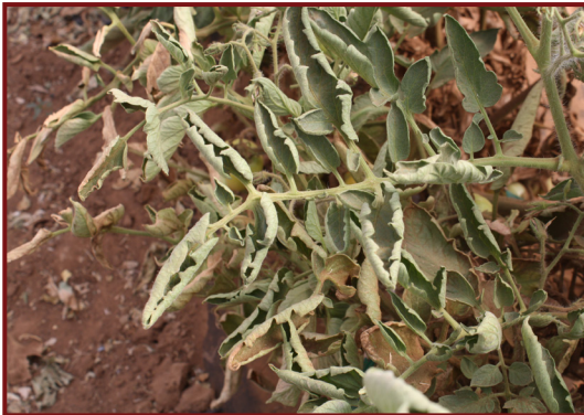
Figure 6. Moderate physiological leaf roll

Mild leaf roll generally does not lower yields or quality, though severe symptoms may cause flowers to drop and fewer fruit to set.