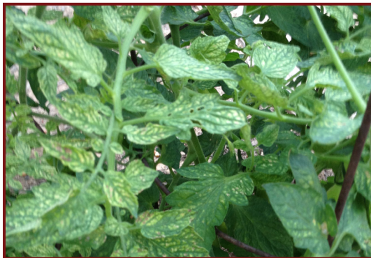
Figure 10. Mosaic patterns on tomato leaves

Hundreds of viruses can cause leaf curling and stunting in tomatoes. Though initial virus symptoms can be confused with a phenoxy-based herbicide damage, the disease often progresses to include yellow-green mosaic patterns on the leaves (Fig 10).