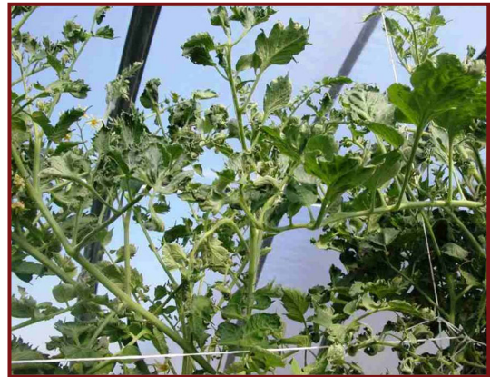
Figure 7. Dicamba injury to tomato leaves

Many home gardens are close enough to cotton and corn fields for drifting 2,4-D, dicamba, or other hormone-type herbicides to cause serious damage. Tomato plants are extremely sensitive to these herbicides: they can be injured by concentrations as low as 0.1 ppm. If only a little of the herbicide reaches the tomato plants, they can recover, but yield will definitely suffer (Fig. 7).