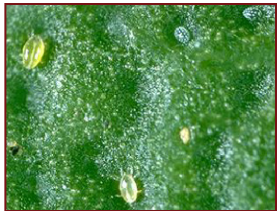
Figure 9. Broadmites and broadmite eggs

If you cannot see the broad mites readily, look for the eggs, which are white, oval-shaped and have ridges or bumps. This mite's eggs are distinct—they look like Christmas ornaments (Fig. 9). Eggs develop into adults in about 4 to 6 days in hot weather and 7 to 10 days in cool weather.