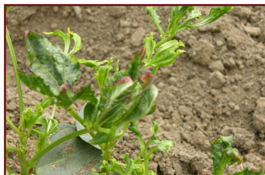
Figure 3. Curling leaves on a bean plant