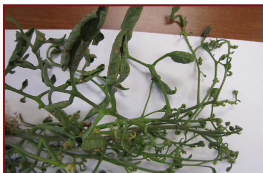
Figure 2. Severely twisted tomato leaves