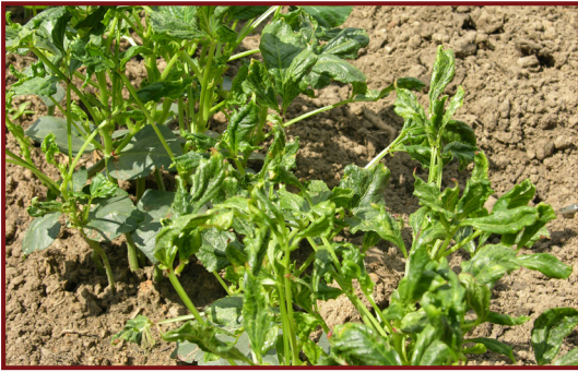
Figure 4. Curling leaves on an eggplant