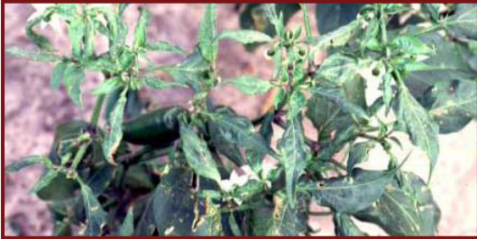
Figure 5. Curling leaves on a pepper plant