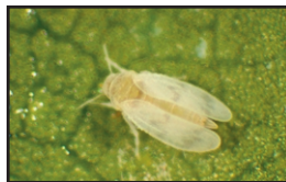
Carlos Bogran, TAMU

This is an occasional pest of crops and ornamental plants, especially hibiscus. The adults are slightly larger than silverleaf and greenhouse whiteflies. They can be recognized by two irregularly shaped (in zig-zag pattern) gray bands on the front pair of wings. Except for these banded front wings, the adults are very similar in size and shape to adult greenhouse whiteflies.