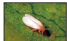
Carlos Bográn, TAMU

The silverleaf whitefly is the most economically important whitefly species in Texas. Adults are 0.8-1.2 millimeter long with white wings (without markings)