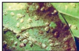
Bastiaan Drees, TAMU

Cultural control practices are aimed at avoiding or preventing whitefly infestations, eliminating sources of whiteflies and keeping whiteflies out of growing areas. To implement cultural control you should: