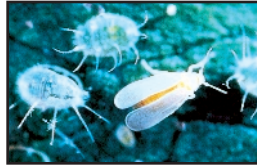
Michael Parrella, U. California Davis

This is an occasional pest, especially in greenhouses. Adults are about the same size as the silverleaf whitefly (0.9-1.1 millimeter). The wings are held nearly parallel to the leaf and cover the abdomen when at rest. Eggs are occasionally laid in circular patterns on plants with smooth leaves. Eggs are oblong, smooth and are initially yellow but darken before hatching. Pupae are oval, slightly raised (with vertical sides) and have a fringe of wax filaments along the perimeter of their upper surface. Relatively large wax filaments project from their bodies; the number and length of these filaments varies with the host plant. Their hosts include more than 200 plant species.