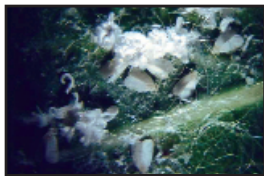
Bastiaan Drees, TAMU

A lthough there are approximately 1,200 species of whiteflies worldwide, only a few species are of economic importance. Most whitefly species have a narrow range of host plants, but the ones that are considered pests may feed on and damage many vegetable and field crops, greenhouse and nursery crops and house plants.