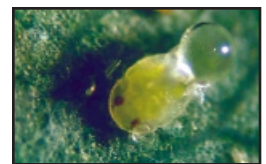
Bastiaan Drees, TAMU

Whiteflies can damage plants directly or indirectly. Direct damage is caused through their feeding, which removes plant sap and stunts plant growth, especially in young plants. Silverleaf whitefly feeding has been associated with several plant disorders, including silverleaf of squash, stem blanching and whitening of poinsettia and cruciferous vegetables, and irregular ripening of tomatoes. Indirect whitefly damage is caused by the large amounts of sticky honeydew secreted during feeding. Honeydew may cover plants and support the growth of sooty mold, which reduces the plant's ability to use light for photosynthesis. In addition to direct and indirect damage, whiteflies may carry and transmit viral diseases that can severely damage susceptible plants.