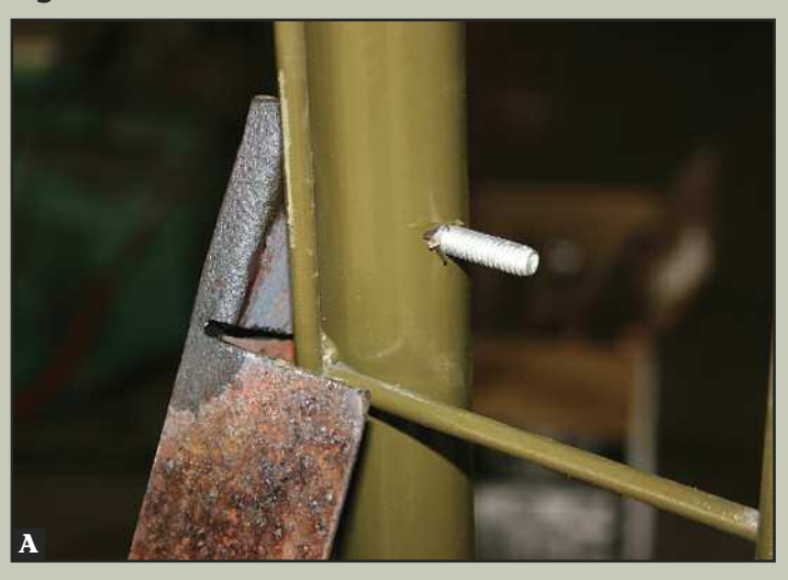
A bolt attaches the bracket to the door frame (A). Once attached, rope or chain provides support to the bracket (B).

iron (Fig. 3). This hole will be used to attach a trip wire to the trigger mechanism. The hole can be equipped with an eyebolt if desired.