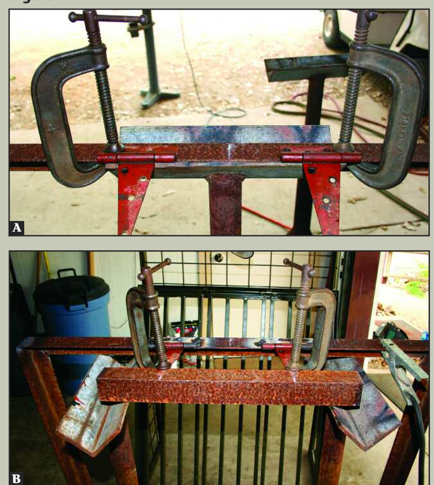
C-clamps secure two T-hinges to the bracket (A). Once secured, a welding machine is used to tack hinges into place. A small piece of angle iron is attached to the other side of the hinges to construct the trigger mechanism (B).