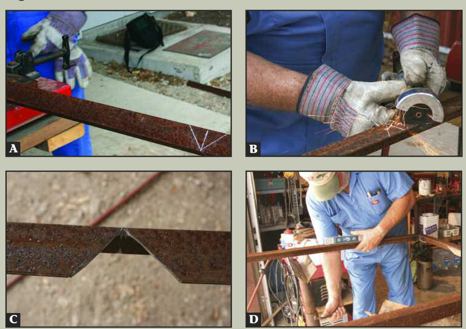
A piece of angle iron marked for cutting (A). After cutting (B and C), the iron can be heated and bent to form the desired configuration (D). The bracket is then welded. Designs may differ, depending on the door style.