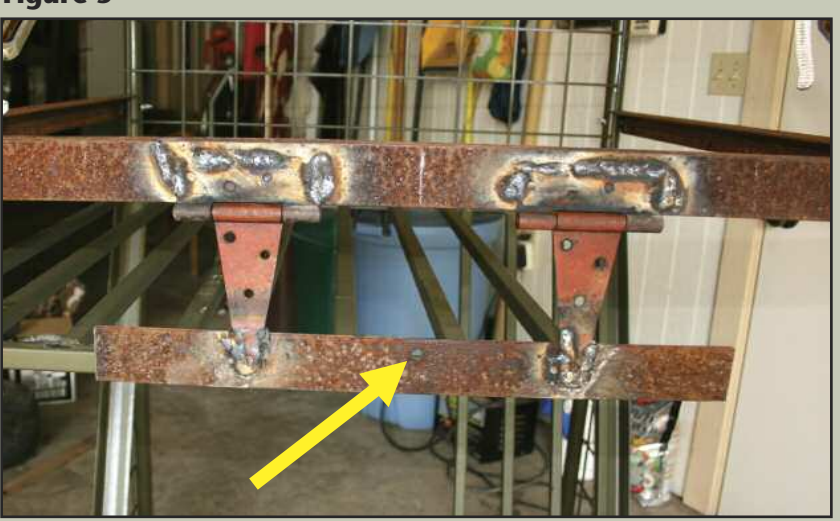
A ¾-inch metal drill bit was used to drill this small hole into the trigger mechanism so that it can be attached to a trip wire.