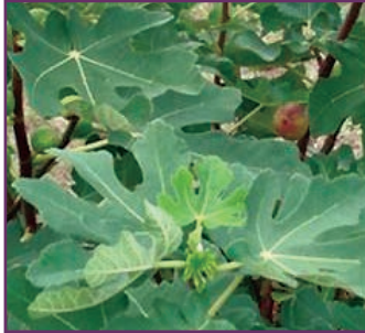
Figure 7. 'Bournabat'