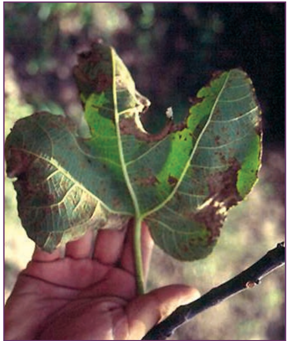
Figure 12. Fig rust on foliage

Figs bear their first crop in late spring, but many varieties produce a larger crop in late summer through fall. When frozen to the ground, the fall crop may be smaller, delayed, or in some varieties, absent.