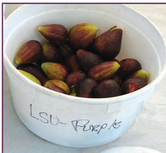
Figure 9. 'LSU Purple'