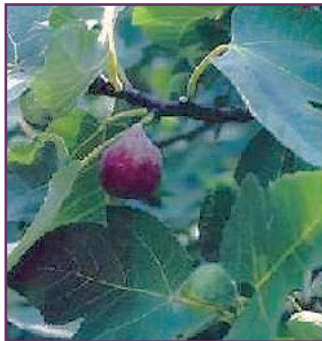
Figure 3. 'Celeste'