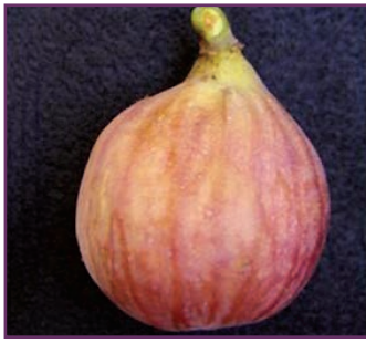
Figure 6. 'Blue Giant'