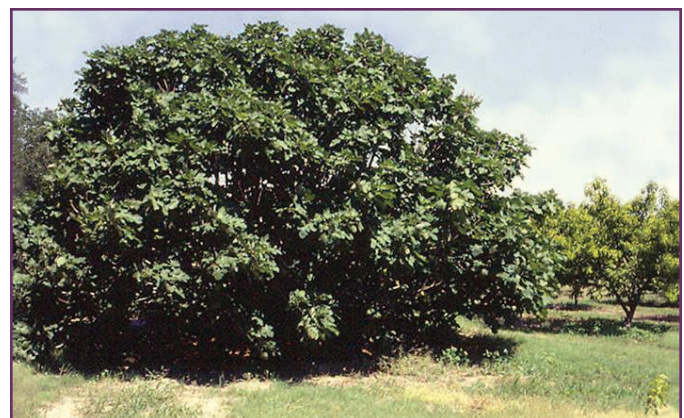
Figure 1. Multi-trunked fig tree

Although commercial fig cultivation in Texas has been largely unsuccessful, small dooryard plantings can meet a family’s needs and provide some limited income from local sales. Because figs must be ripened on the tree and are quite perishable, even modest commercial ventures must have well-planned marketing strategies