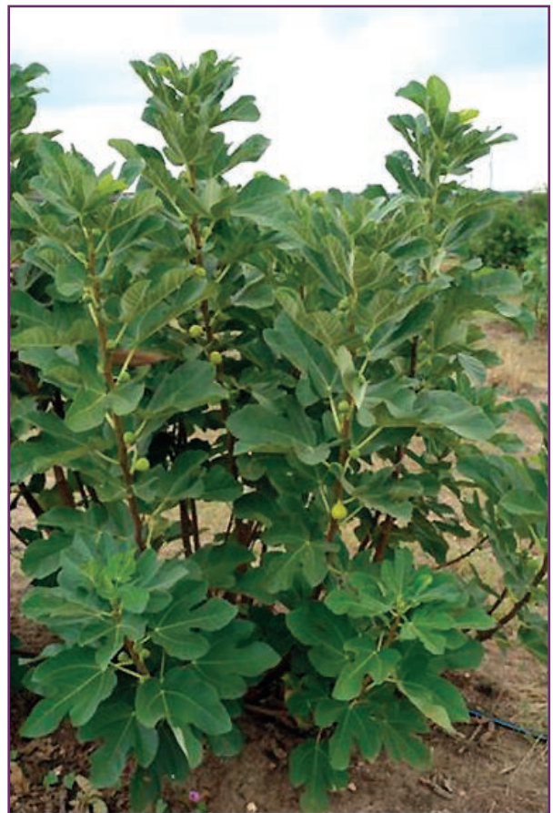
Figure 10. Young, multi-trunk fig trees

To minimize freeze injury during dry falls and winters, thoroughly water the fig trees a few days before a hard freeze. Figs can usually tolerate sus-