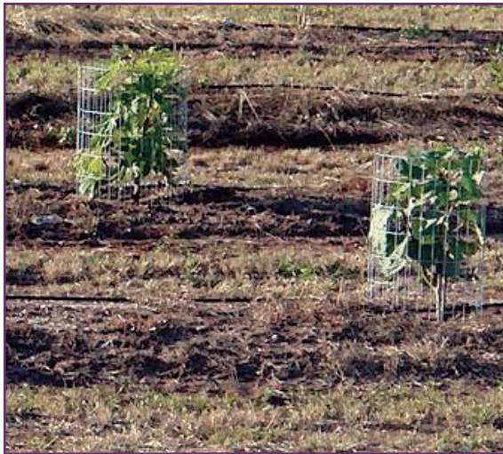
Figure 11. Young fig plants fitted with wire cages to be packed for freeze protection

tained temperatures to 17°F, but young plants and young, tender trunks are more susceptible than are older, mature trunks.