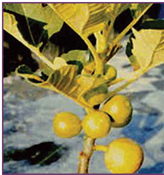
Figure 2. 'Alma'