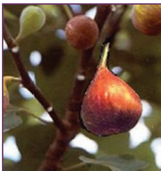
Figure 4. 'Texas Everbearing'