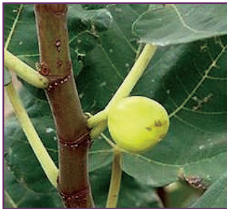
Figure 8. 'Lemon'