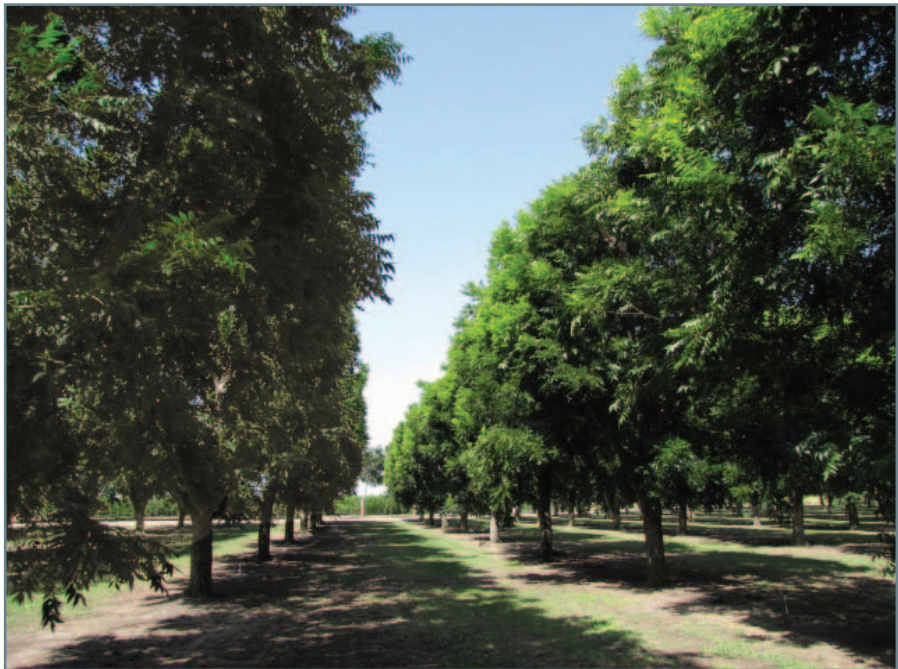
Figure 16. Well-managed pecan orchards on good sites can produce from 1,000 to 2,000 pounds of nuts per acre per year.

Well-managed orchards on good sites can produce from 1,000 to 2,000 pounds per acre per year (Fig. 16). Pecan production