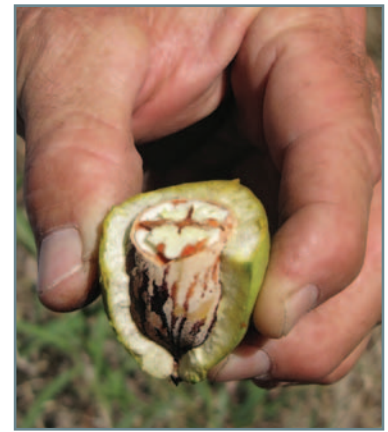
Figure 1. Improved pecan nuts are also called papershell pecans because of their thinner shells.