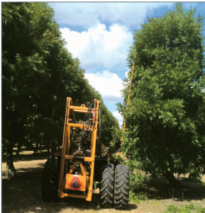
Figure 9. A mature orchard spaced at 30x30 feet, hedged annually to maintain sunlight.

Tree removal strategies differ somewhat for square, rectangular, and diamond orchard planting designs. For planting designs and