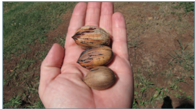
Figure 7. Nuts from three pecan varieties. From the top down: Lipan, Pawnee, and Kanza.

For more information about pecan varieties, see the Texas Pecan Handbook , which is available from the Texas A&M AgriLife Bookstore at https://agriflifebookstore.org/ .