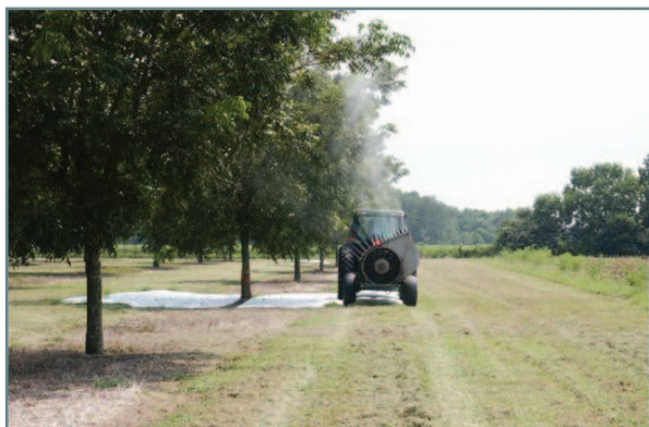
Figure 3. A powered pecan harvester.