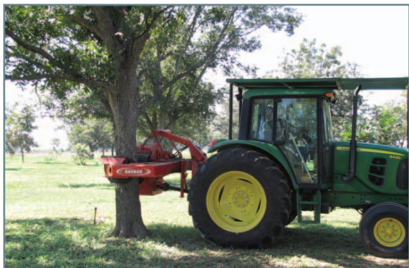
Figure 2. A powered trunk shaker.

The climate in all areas of Texas is suitable for pecans. However, crops can be damaged by early fall