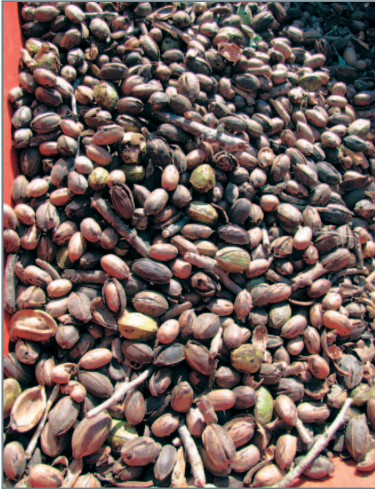
Figure 14. Machine-harvested pecans and trash before processing.