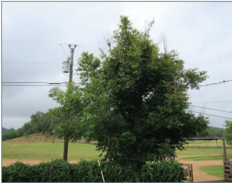
Figure 11. Severe zinc deficiency symptoms in pecan: bunched canopy, small leaves, and limb dieback.

Zinc: Foliar zinc sprays are essential for maximum leaf expansion and pecan growth (Fig. 11). Applying zinc to the soil or via drip systems is ineffective unless the soil pH is 6.0 or less and no limestone has been applied.