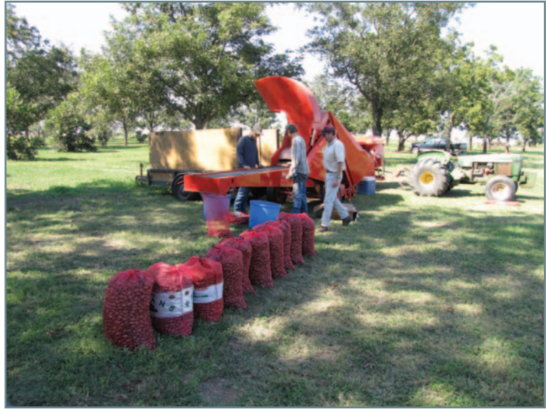
Figure 15. A pecan cleaner and sacking operation.