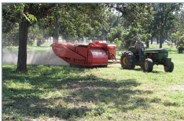
Figure 4. An air-blast pecan tree sprayer.