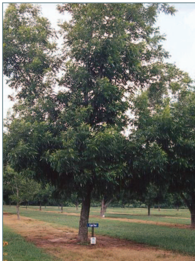
Figure 10. A “sod and strip” orchard floor.

Although some Texas growers graze sheep, cattle, goats, and other animals in improved orchards, it is generally not recommended because livestock can compact the soil, damage young trees, and interfere with irrigation, spraying, and harvesting.