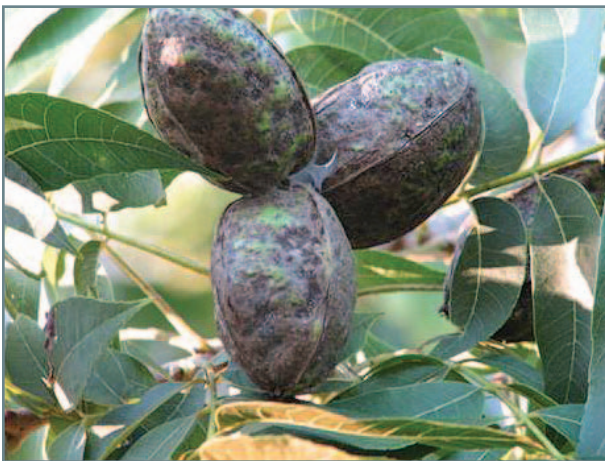
Figure 12. Pecan scab on pecan shuck.

Potassium and phosphorus: Potassium fertilizer may be needed every 1 to 3 years, especially on sandy soils. Phosphorous fertilizer is seldom needed in Texas, and applying it can aggravate other micronutrient deficiencies. Monitor both elements regularly through soil and leaf analysis.