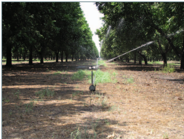
Figure 5. Solid set sprinkler irrigation.

Pollination: Pecan trees are pollinated by wind. The pollen is blown from male flowers called catkins to female flowers called