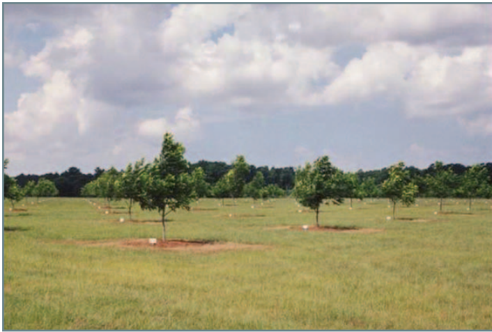
Figure 8. A well-spaced young pecan orchard.