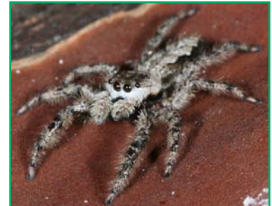
Figure 3. Adult jumping spider.

Hundreds to thousands of wolf spiders may live in the average backyard lawn, where they feed on insects and small organisms. Although they may be a nuisance, they can control other pests. Because they are so plentiful, wolf spiders commonly enter homes under gaps in doorways. Although some wolf spiders can be aggressive if handled improperly, they are generally not dangerous to people or pets and can usually be picked up with bare hands or