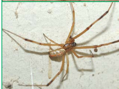
Figure 10. Female widow spider (top), male widow (bottom).

piles, garages, cellars, shrubbery, crawl spaces, rain spouts, termite bait stations, gas and electric meters, and other rarely disturbed places.