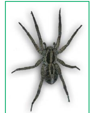
Figure 4. Wolf spider, Schizocosa spp.