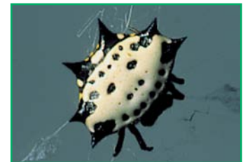
Figure 6. Spinybacked orbweavers are common in wooded areas.