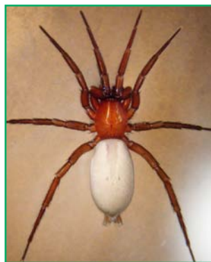
Figure 1. Ground spider showing cephalothorax, abdomen and eight legs.

The spinnerets and a distinct abdomen distinguish spiders from the other arachnids.