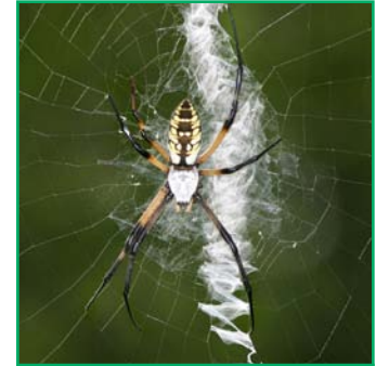
Figure 5. Argiope spider in a web.

In recent years, long-jawed orbweavers in the genus Tetragnatha have built large communal webs. These “super webs” are unusual and have most commonly been found near water, especially where there food sources like midges or other