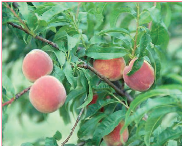
Figure 1. Tree-ripened peaches

In planning a new orchard, prospective growers should take this risk into account and plan orchard size accordingly. If peach production is a part-time enterprise, 2 to 5 acres of orchard may be appropriate; a full-time, one-person enterprise may require closer to a 20- to 25-acre planting.