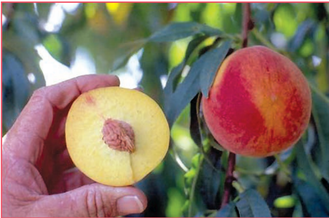
Figure 11. High-quality, tree-ripened fruit.

Growers must therefore harvest fruits that are at a mature stage, and harvest and handle them carefully.