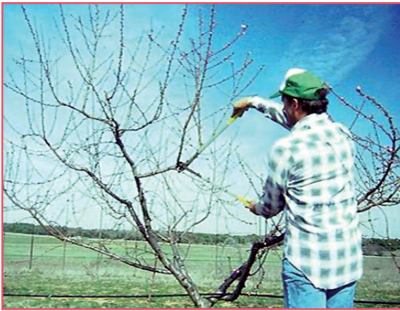
Figure 9. Peach tree pruning.