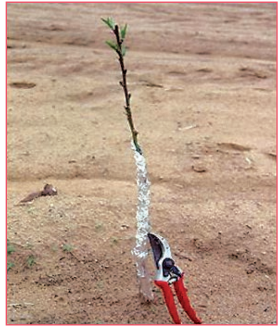
Figure 5. Cutting back at planting and aluminum foil wrapping of lower trunk.

To prevent trunk girdling in later years, remove all of the foil after the first growing season.