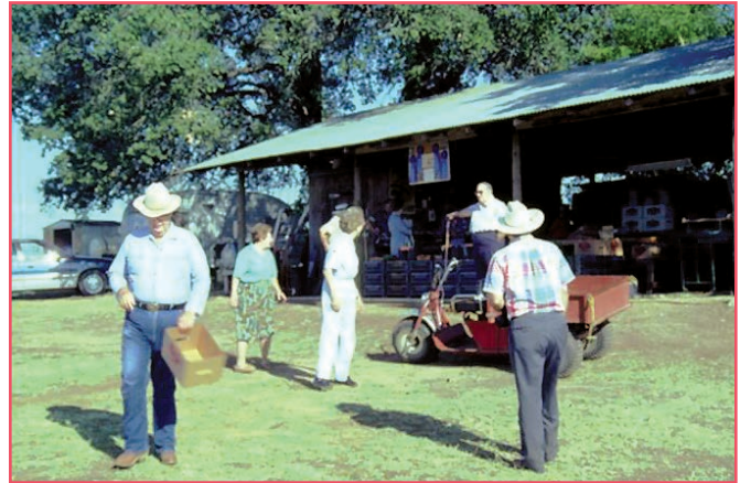
Figure 12. Selling peaches at the farm gate.

http://aggie-horticulture.tamu.edu/fruit-nut