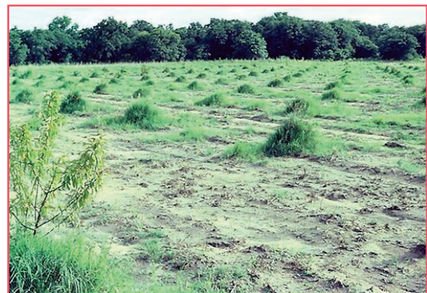
Figure 6. Lack of weed control causing poor tree survival, reduced growth, and orchard failure.

Weed control is critical in the first year; if left unchecked, weeds can drastically reduce the first year's growth. Most weeds remove water and nutrients from the soil more aggressively than can the newly set peach trees. Often these small trees can be seen standing in lush green grass with the telltale red spots of nitrogen deficiency on their leaves (Fig. 6). The trees will grow much bigger if weeds are controlled during the first year.