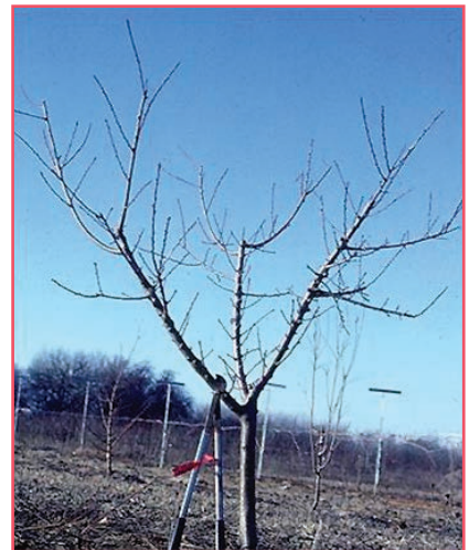
Figure 8. Winter appearance of open center tree.