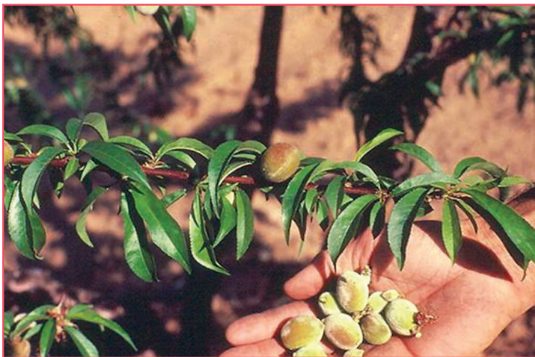
Figure 10. Hand-thinning of developing fruit.

Mechanical thinning by shakers can be successful if done carefully. The major drawbacks are that the shakers tend to damage the trees if used improperly, and that growers must wait for the fruit to get large enough to be