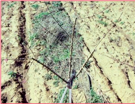
Figure 7. Early training of young tree to open center design.

Weeds can be controlled by mechanical methods such as tilling or disking and by chemical methods using herbicides.