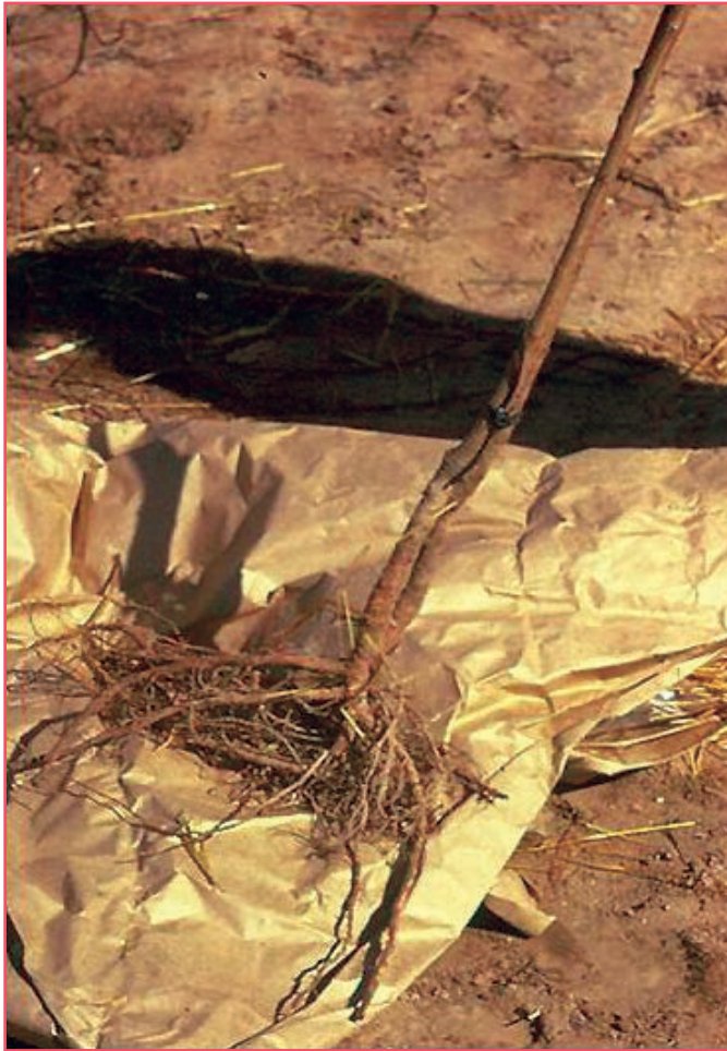
Figure 4. Healthy nursery stock.