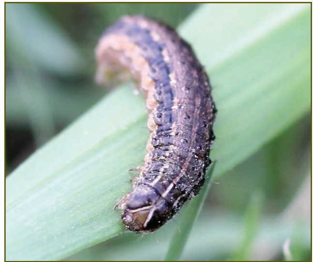
Figure 6. Inverted “Y” on head of a fall armyworm.

sixth larval stages eat over 90 percent of the total foliage the armyworm will consume over its life span. This usually means that early damage is often overlooked, and most defoliation takes place over a relatively short period during the later development stages. Caterpillars feed throughout the day but are typically most active early in the morning and late in the evening. They can often be observed easily at these times.