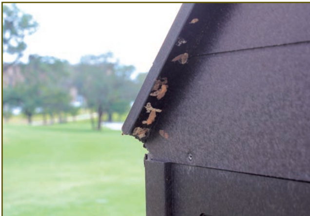
Figure 5. Fall armyworm eggs laid on a golf course water cooler.

Damage by fall armyworm caterpillars (larvae) initially appears at the tips of the grass blades. The tips look transparent due to the plant cells being eaten. If left uncontrolled, caterpillars may continue feeding, stripping tissue from turfgrass leaves, and leaving brown areas adjacent to green turf.