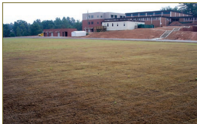
Figure 2. Fall armyworm damage to a football field. on golf courses, athletic fields, and home landscapes. The fall armyworm has four life stages: egg, larva, pupa, and adult. Adult moths (Fig. 3) are generally gray, with a 1½-inch wingspan and