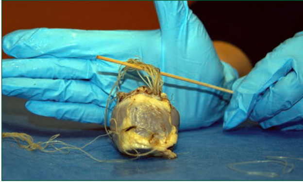
Figure 8. Dog heart infected with dog heartworms.