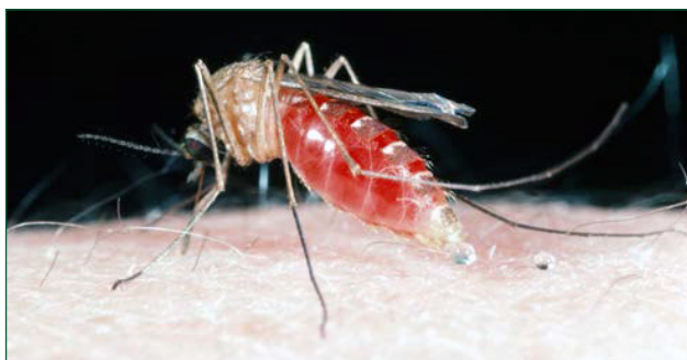
Figure 5. Mosquito adult.

Inactive females rest in protected areas that are typically dark or shaded, humid, and cool in the summer or warm in the winter.