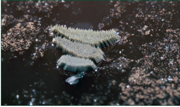
Figure 2. Mosquito eggs.