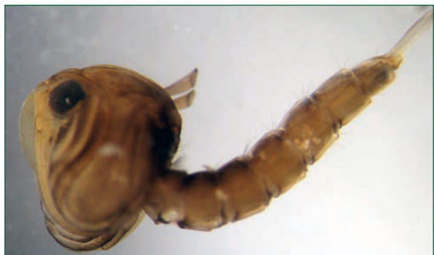
Figure 4. Mosquito pupa.

The pupae are comma-shaped and, like the larvae, breathe through air tubes at the water surface. The front of the pupa's body is greatly enlarged, consisting of a fused head and thorax (Fig. 4). A pair of breathing tubes, or trumpets,