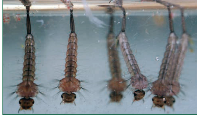
Figure 3. Mosquito larvae.

While feeding or breathing, mosquito larvae assume distinctive positions in the water. For most species, the larva breathes through an air