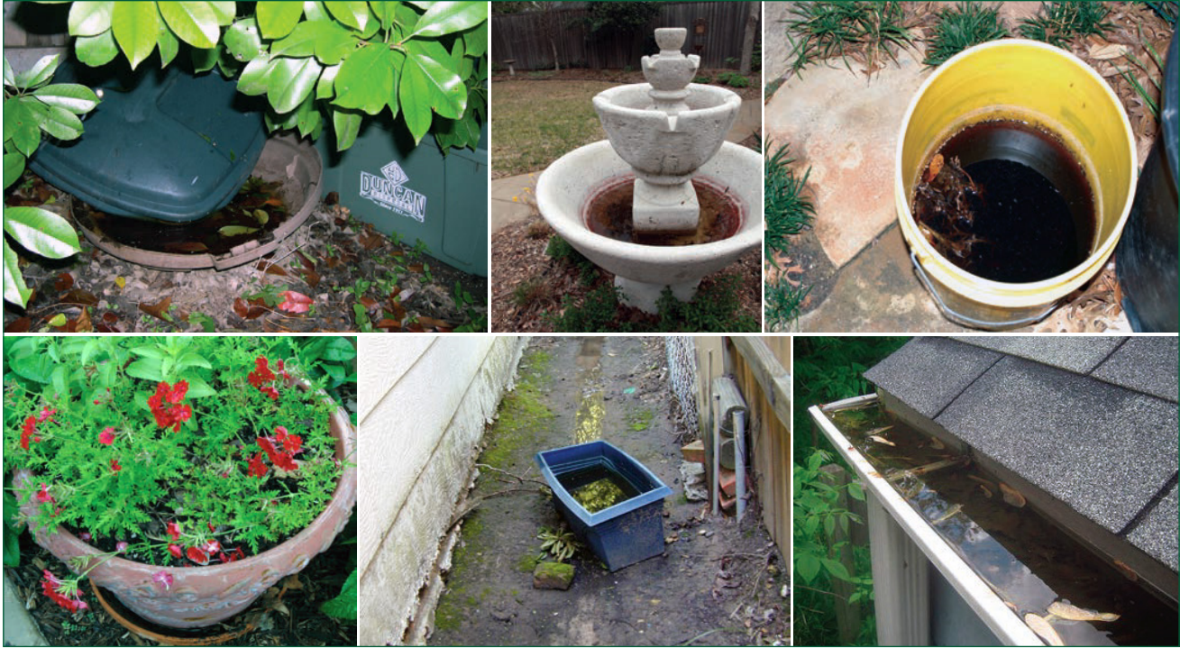
Figure 6. Artificial containers that can serve as mosquito egg-laying sites: (from top left) a garbage can lid, birdbath, plastic bucket of water, flowerpot, plastic container, and a clogged rain gutter.

ual homeowners as well as organized areawide efforts led by groups such as local government agencies or private companies.