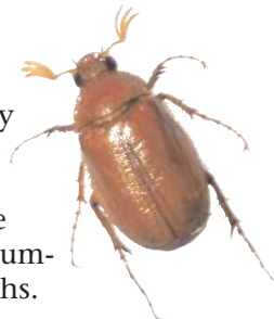
Figure 2. Adult white grubs, often called May or June beetles, are commonly attracted to lights at night.

The most important turfgrass-infesting white grubs in Texas are the June beetle, Phyllophaga crinita (Figure 2), and the southern masked chafer, Cyclocephala lurida . Warm season grasses like bermudagrass, zoysiagrass, St. Augustinegrass and buffalograss are attacked readily by both types of white grubs, with most lawn damage occurring during summer and fall months.