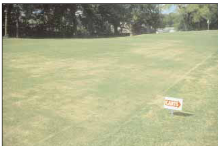
Figure 1. Golf course fairway damaged by white grubs.

White grubs, sometimes referred to as grubworms, injure turf by feeding on roots and other underground plant parts. Damaged areas within lawns lose vigor and turn brown (Figure 1). Severely damaged turf can be lifted by hand or rolled up from the ground like a carpet.